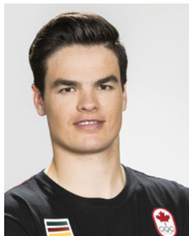
Mikael Kingsbury Freestyle Skiing