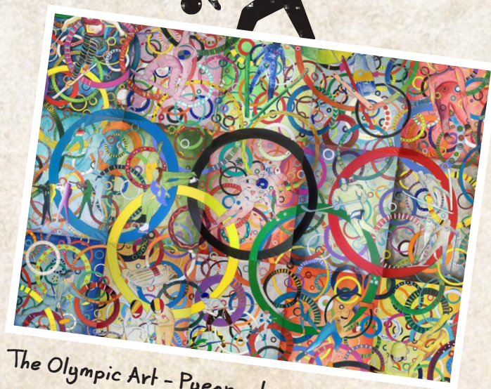
The Olympic Art - Pyeongchang

The PyeongChang 2018 Winter Olympics did something different to support the arts. They asked Olympic athletes who were also artists to create a painting of each of the winter sports. One new picture was painted each day of the 15 days of the Games. It was all part of the Olympic Art Project.